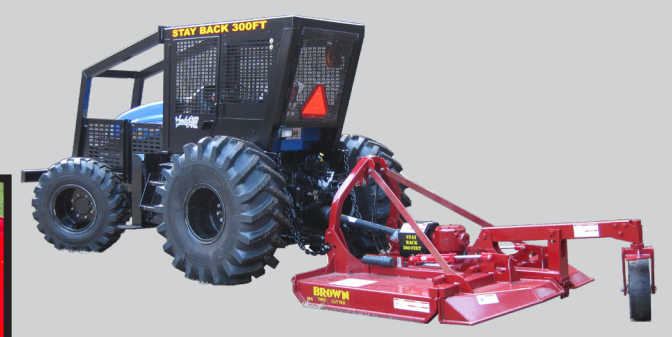
The Best Choice for Clearing Rights-Of-Way SAFELY and Quickly.

The Brown Tree Cutter Is The Only True Heavy Duty Cutter At Over 1-1/4 Tons In Unit Weight. Its Unmatched Ability And Design Will Handle Your Right-Of-Way Management With Ease.