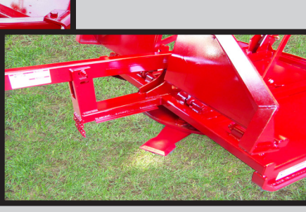
Folding Deck (Doors Open)

The Brown Tree Cutter Is The Only True Heavy Duty Cutter At Over 1-1/4 Tons In Unit Weight. Its Unmatched Ability And Design Will Handle Your Right-Of-Way Management With Ease.